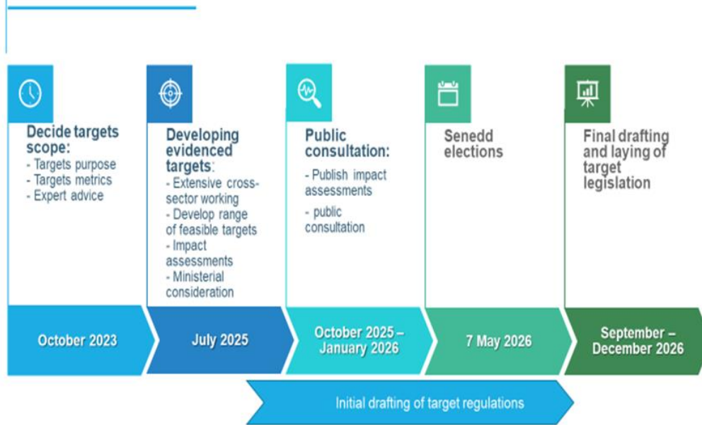
Figure 2: PM2.5 targets development timeline